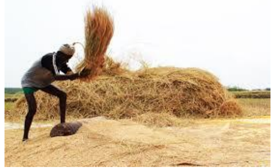
Bashing the wheat stalks to separate the chaff and grain from the stalks

2 Gideon put a sheepskin on the threshing floor at night. The 1 st time, he asked God to show him that God wanted him to save the Israelites by making the sheepskin wet and the threshing floor dry, the next morning the sheepskin had a bowl full of water in it and the threshing floor was dry. The 2 nd time he asked God to make the threshing floor wet and the sheepskin dry, the next morning the threshing floor was wet with dew and the sheepskin was dry. The threshing floor is usually a large area that has wind.